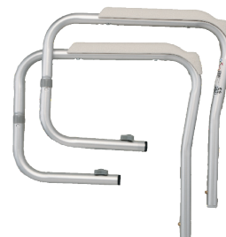
Arm Rest Frames